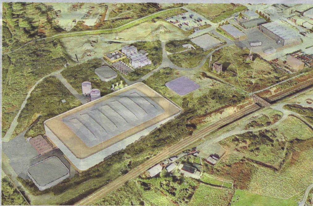
An aerial view of the proposed mine site - the new ore concentrator is the main building left of centre.

● Details of the planning application will shortly be available at http://cornwall.gov.uk/ using reference number PA10/04564.