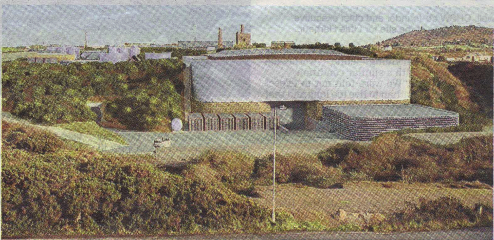
The proposed ore concentrator building, viewed from the west.